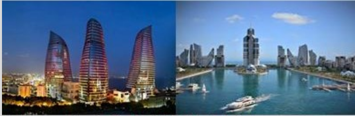
Training dates and location: March 2—4, 2016, Baku, Azerbaijan

Tested during more than 40 years of successful implementation within various organizations & business companies all around the World!